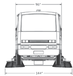
Model shown with optional equipment. Design and specifications subject to change without notice. Specifications may vary depending on chassis type.