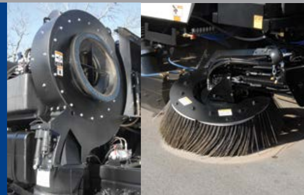
Whisper Wheel SM Fan System

The Schwarze A7 Zephyr is a chassis mounted, regenerative air runway sweeper with an 8.4 cubic yard hopper. With over 20 years of successful operation throughout the world, the A7 Zephyr is a heavy duty workhorse that will provide a high quality option with a low cost of ownership. Come to the people you know, for the products you trust.